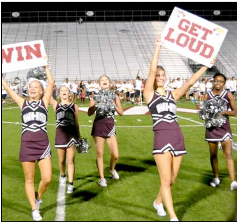
The 3rd Annual Waller ISD Community Pep Rally was held at the Waller ISD Stadium on August 20. Pictured are the Waller High School cheerleaders encouraging the crowd to show their school spirit.

The Waller High School Bands demonstrated their music talents as the Waller ISD and PeeWee cheer and sports teams ran onto the field. The Waller High School Air Force Jr. ROTC presented the colors and the Waller High School Wranglerettes performed a captivating dance routine. The Waller ISD cheerleaders kept the crowd cheering all night long and even shared some