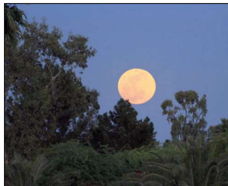
Photo of the supermoon taken on August 29, in Rockport, Texas. The next supermoon will take place on September 27 and will also be a "blood moon".

By CARRIE PRAZAK-GOURLEY The Waller Times