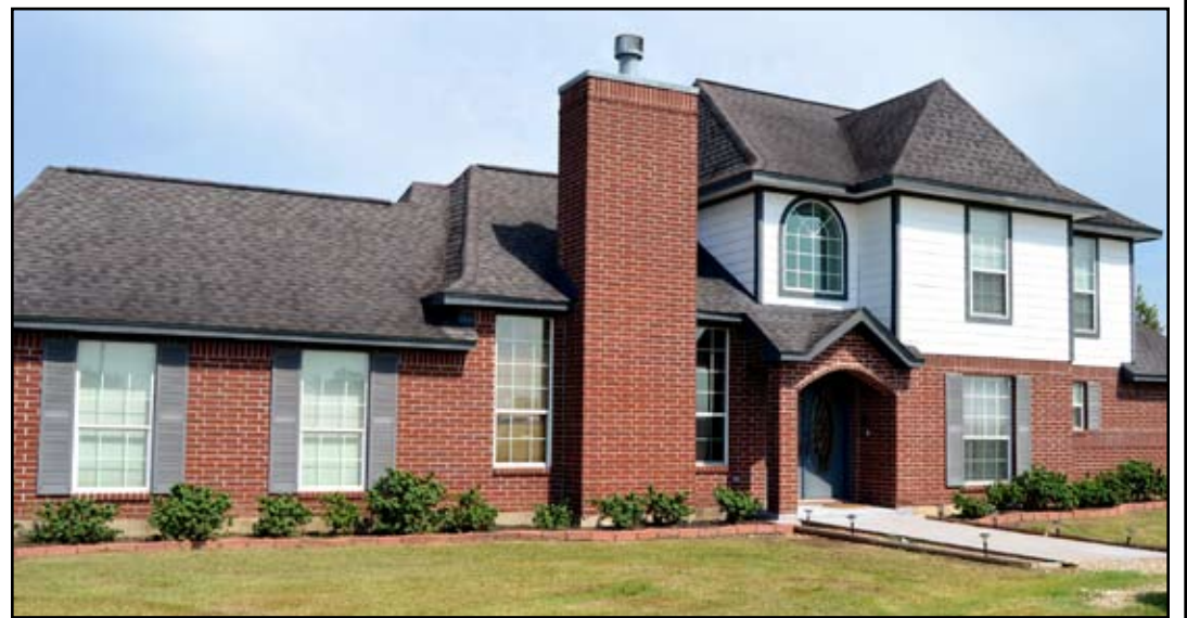
Beautiful country home on 2 acres! Light restrictions, pasture surrounding home and lovely pool with oversized patio.....$340,000