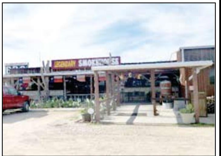
4449 Commercial building on 2 acres with Hwy frontage, all equipment included.....$495,000