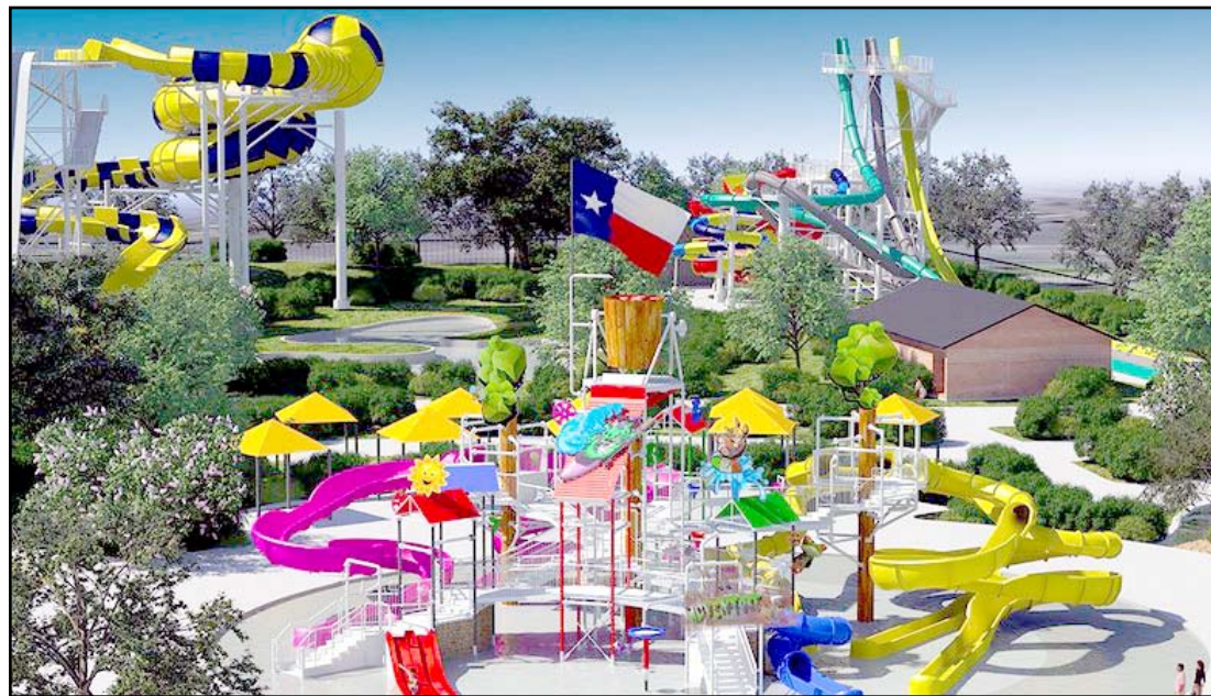
An artist's depiction of the new waterpark, Typhoon Texas, under construction near Katy Mills Mall in Katy, Texas. Internet rendering.