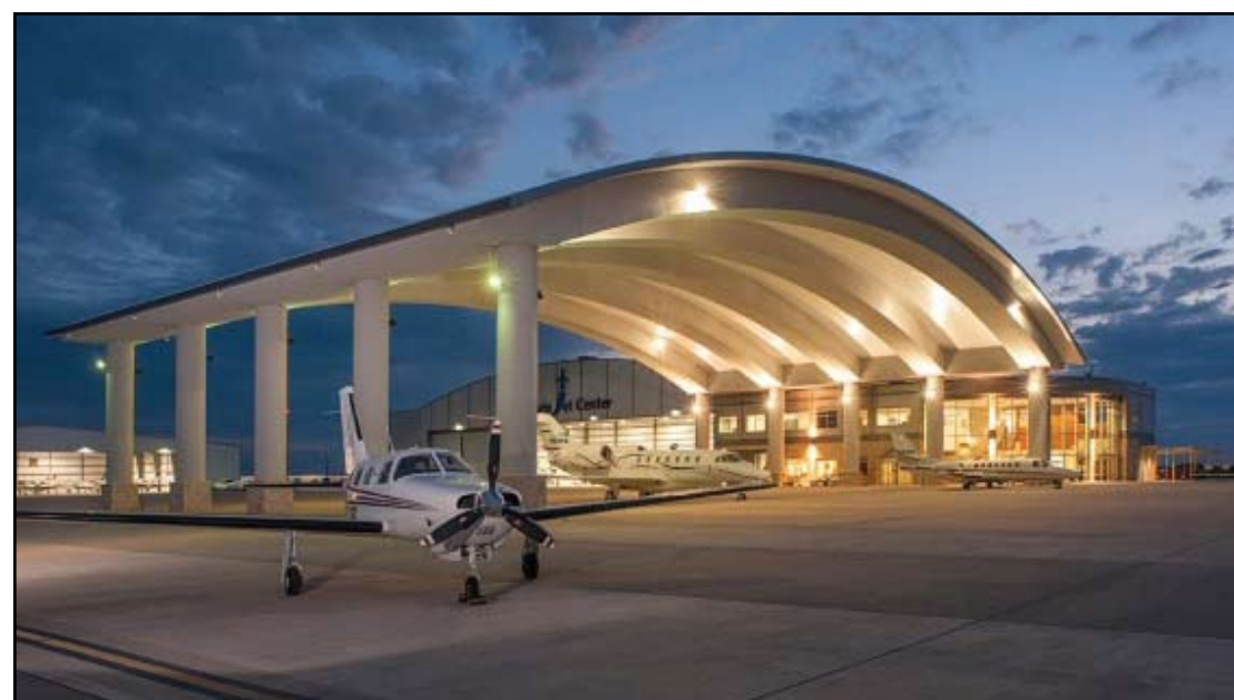
Houston Executive Airport's Jet Center. The airport, located in Brookshire, is currently adding a new hangar to its facilities.

In other action, the court voted unanimously to rescind the burn ban since the KBDI (Drought Index) fell to 420.7585 as of Wednesday, August 26, which is well below the 500 danger level for fire