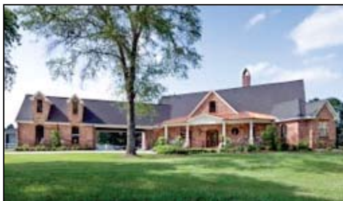
4456 Stunning New Orleans style custom home, with curved mahogany lanai doors that open onto the back patio area, beautiful fireplace, professionally landscaped pool area, large master with custom details, elevators with antique features, theatre room with automatic leather reclining chairs, barn with stalls and guest quarters, on 13 acres with improved pastures.....$1,200,000