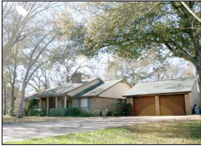
4440 3-2-2 Brick home, sunroom, large living with fireplace, formal dining, large kitchen on over an acre.....$218,000

Open 6 Days a Week & Sunday by appointment