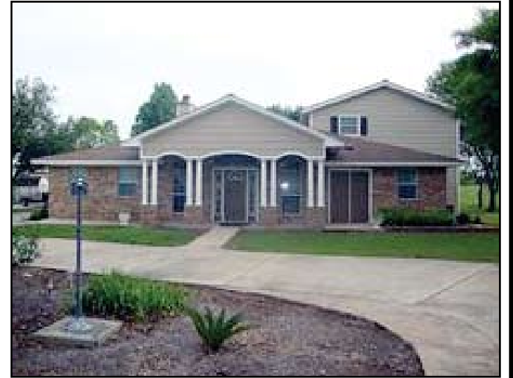
4452 3-3.1-3 Ranch style home with circle drive, fruit trees, workshop, cross fenced, recent roof, ag exempt.....$479,900