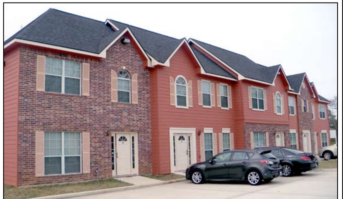
Townhomes - 5-unit townhome building in Prairie View. Each unit is a 2-2. Less than 1 mile from PVAMU campus. Built in 2009.....$510,000