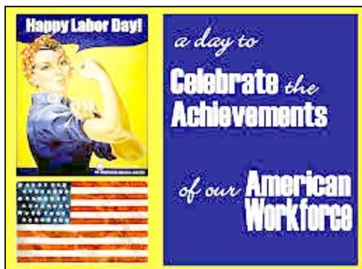
A traditional Labor Day poster from the 1940's, depicting the iconic symbol of labor, Rosie the Riveter, used to demonstrate the vast contribution's of American women to the workforce during WWII.

My father retired in the late 1980's from Transcontinental Gas Pipeline with company retirement (not 401K) and health benefits (which my mother continued to have for years, even after my father's death). His generation was the last to receive the benefits of long-term