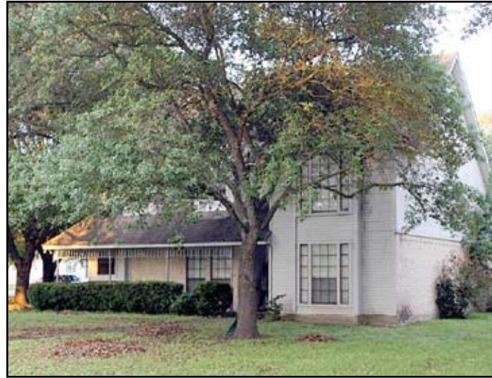
4450 4-2.1-2 Brick home, two story, nice large corner lot with large shade trees.....$196,500