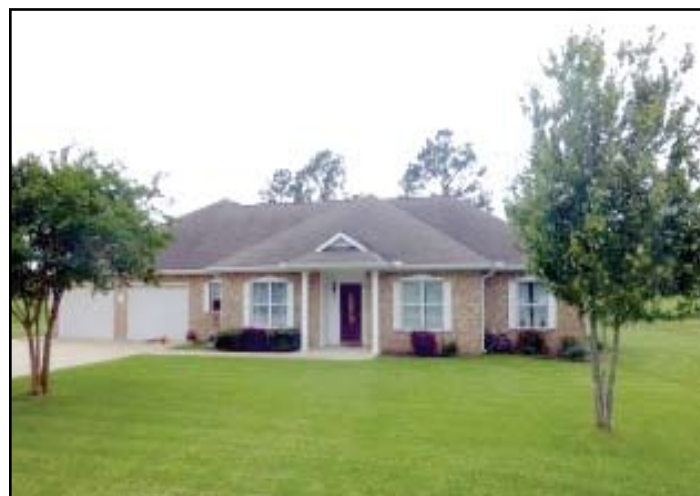
4457 3-2 Brick home on 9th green, 2 1/2 lots, huge island kitchen, formal dining, study, large patio overlooks golf course, garage with shop and half bath.....$237,500