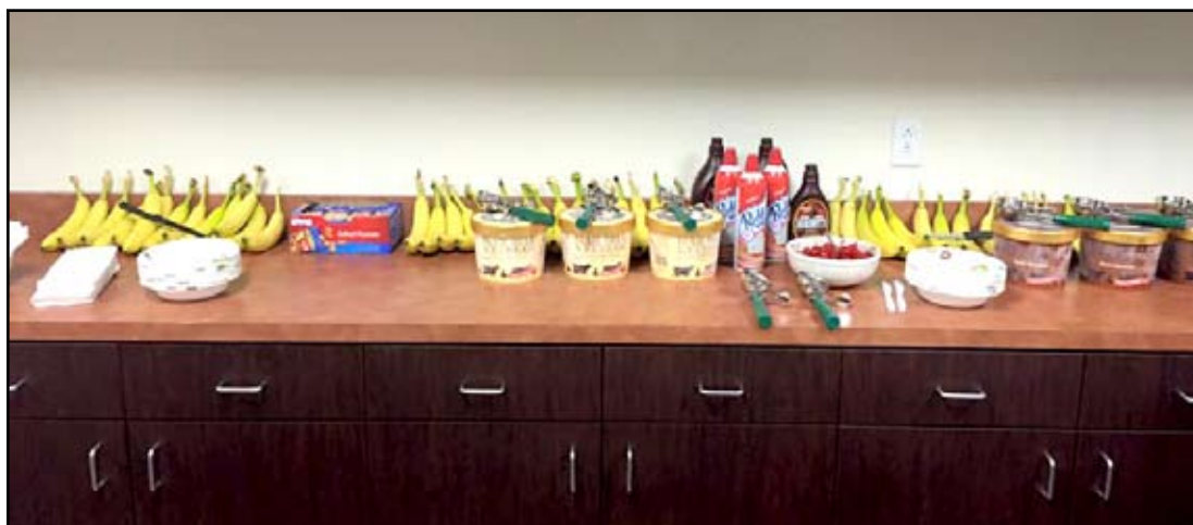
Banana Split Bar.