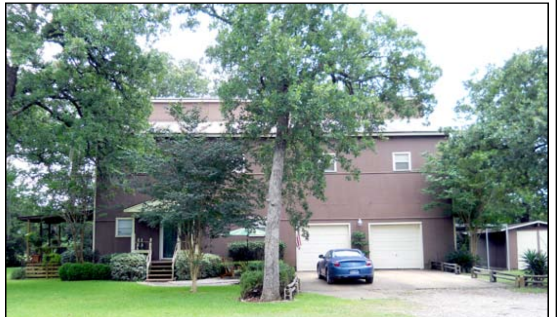
Country Escape - 1,200 sq. ft. 1-1 home on 3.3 acres. Nicely landscaped with covered front porch, deck, hot tub and large workshop.....$180,000