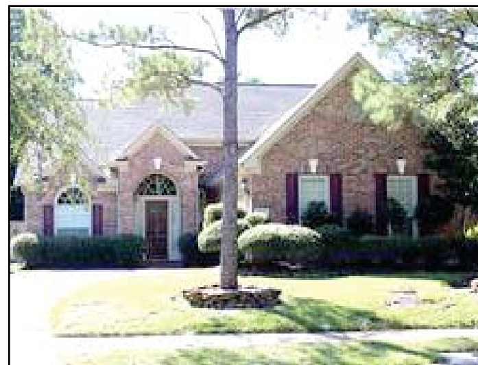
4427 3-2 brick home in Cypress, double sided fireplace, Cy-Fair ISD.....$200,000