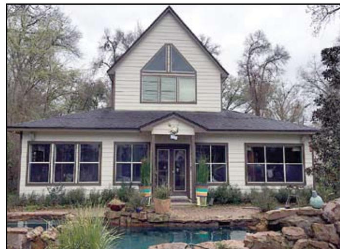
4441 3-2.1/2 two story home on two and a half acres with mature trees, large island kitchen, gated entrance .....$499,000