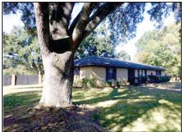
4428 3-2-2 brick home, recent roof, formals, large kitchen on 2 lots.....$107,500