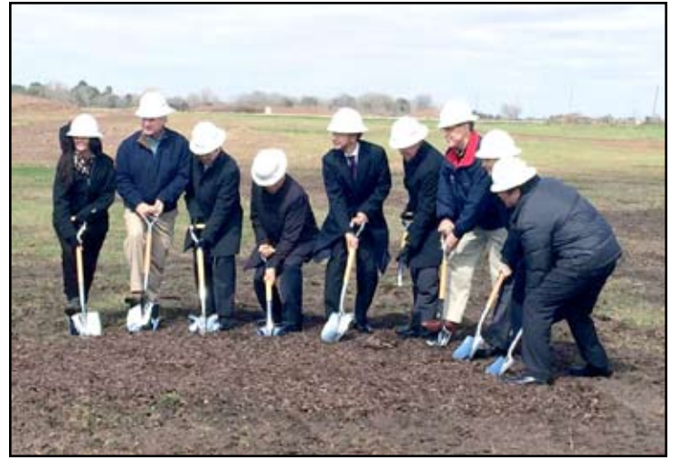
A groundbreaking ceremony was held on the future site of the national headquarters for the Goodman Manufacturing Company, part of the Japan-based Daikin Group, on Thursday, March 5, 2014. Goodman is the largest air conditioning company in the world. Several of their Japanese executives were here for the event as well as local dignitaries.

Waller. We are growing, and all of us have a stake in that growth ... from current and potential businesses to our schools to future residential developments. I'm sure we will experience some growing pains as well, but the overall picture is good.