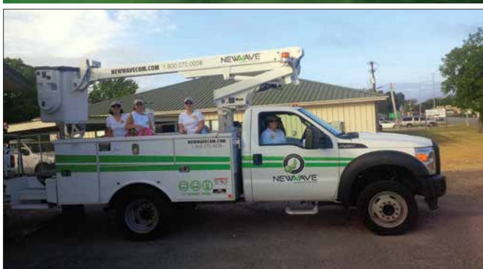
NewWave Communications is your hometown provider and is committed to delivering the entertainment and communications experience you deserve.

NewWave Business has the coverage and capacity to power your business. With over 3,000 miles of fiber in 7 states, NewWave's network delivers the infrastructure and last-mile connectivity your business demands. Our team will customize an advanced business solution to meet your needs and provide the service, coverage and capacity you require.