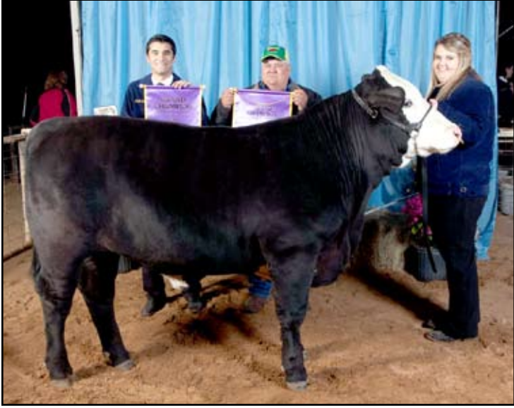
Grand Champion Steer exhibited by Victoria Fife purchased by Dilorio Farms Partnership for $3,250.