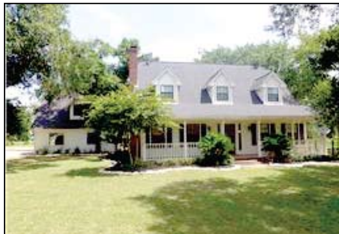
4402 4-2.1 country home on 4+ acres, two story, stone fireplace, built in entertainment center, island kitchen, inground pool with spa, cross fenced, 40 x 40 metal building, barn with stalls...PENDING..$379,900