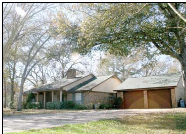
4440 3-2-2 brick home, sunroom, large living with fireplace, formal dining, large kitchen on over an acre.....$230,000

Open 6 Days a Week & Sunday by appointment