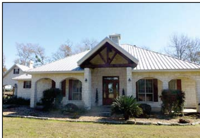
4367 Beautiful custom stone home with cathedral ceilings, stone fireplace, marble counters, beautiful tile flooring on a hill with a view, 6 stall barn, lighted arena, covered RV parking, additional barn, two ponds on 30 acres.....$1,080,000